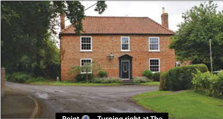
Point 4 - Turning right at The Old Tavern on to Baker's Lane

Look out for our other walks, 'The Armistice Walk', 'The Four Churches Walk', 'The Allington Ramble' and 'The Leaning Tower Walk'