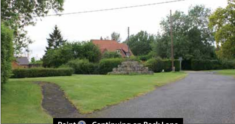
Point 3 - Continuing on Back Lane until it reaches Town Street