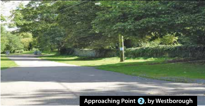
Approaching Point 2, by Westborough Church, where you follow the road ahead