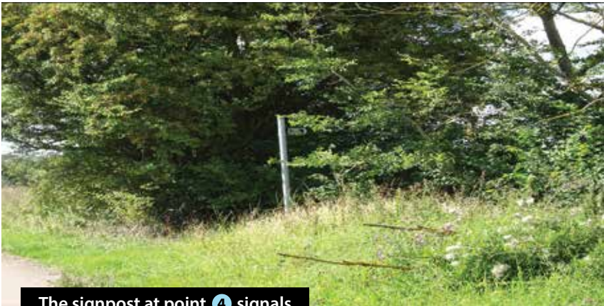
The signpost at point 4 signals the route home across the fields

Look out for our other walks, 'The Allington Ramble' and 'The Leaning Tower Walk'