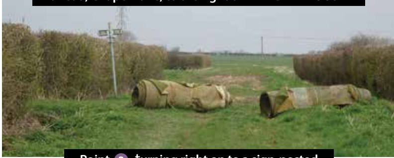
Point 2 , turning right on to a sign-posted path across a field