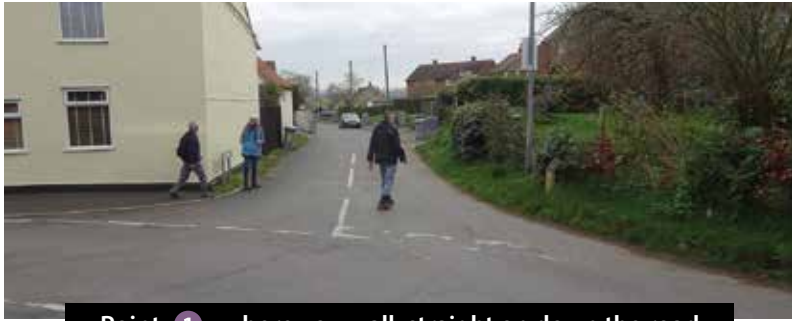
Point 1 , where you walk straight on down the road ahead, Chapel Lane, to the right of 'THE BAKEHOUSE'