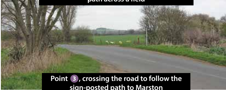
Point 3 , crossing the road to follow the sign-posted path to Marston

Design and artwork Rare Blue Media, Foston